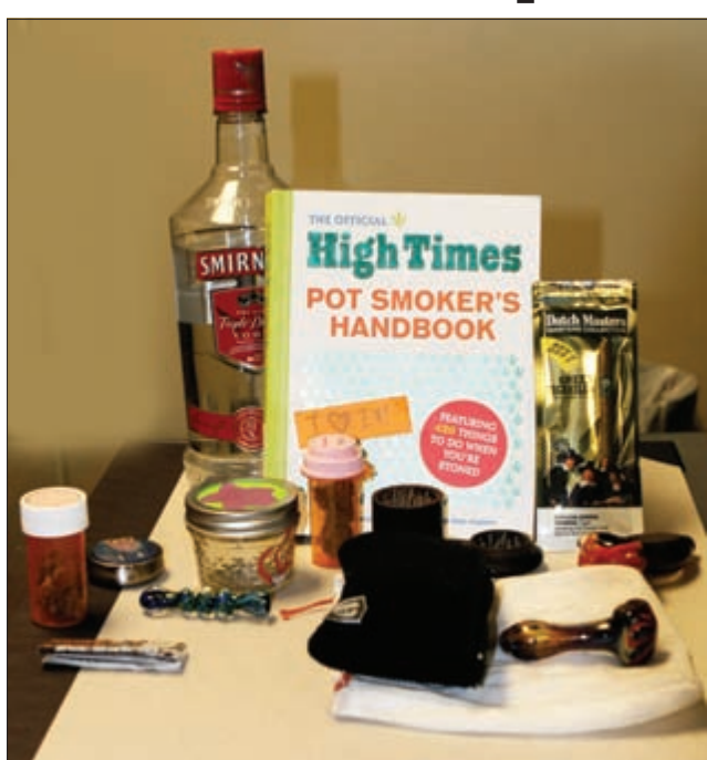
All you ever wanted to know about pot