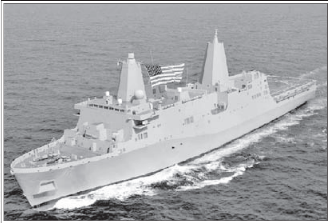
24 tons of steel from the World Trade Center